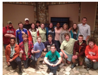
Youth Ministry Gatherings & Idea Sharing